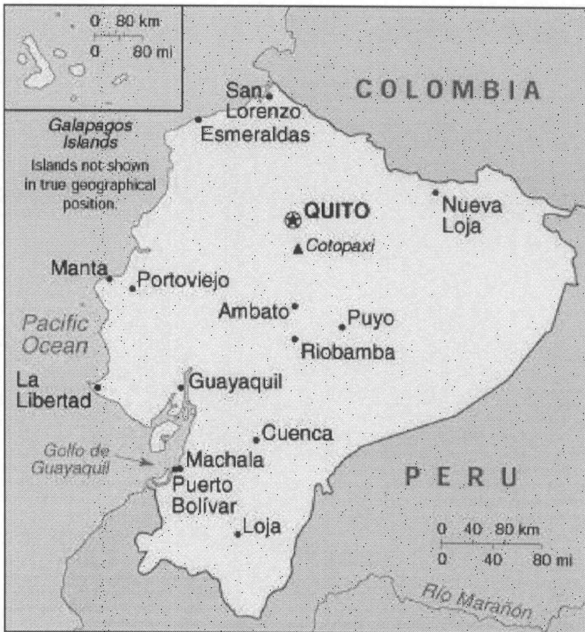
Figure 1 Map of Ecuador