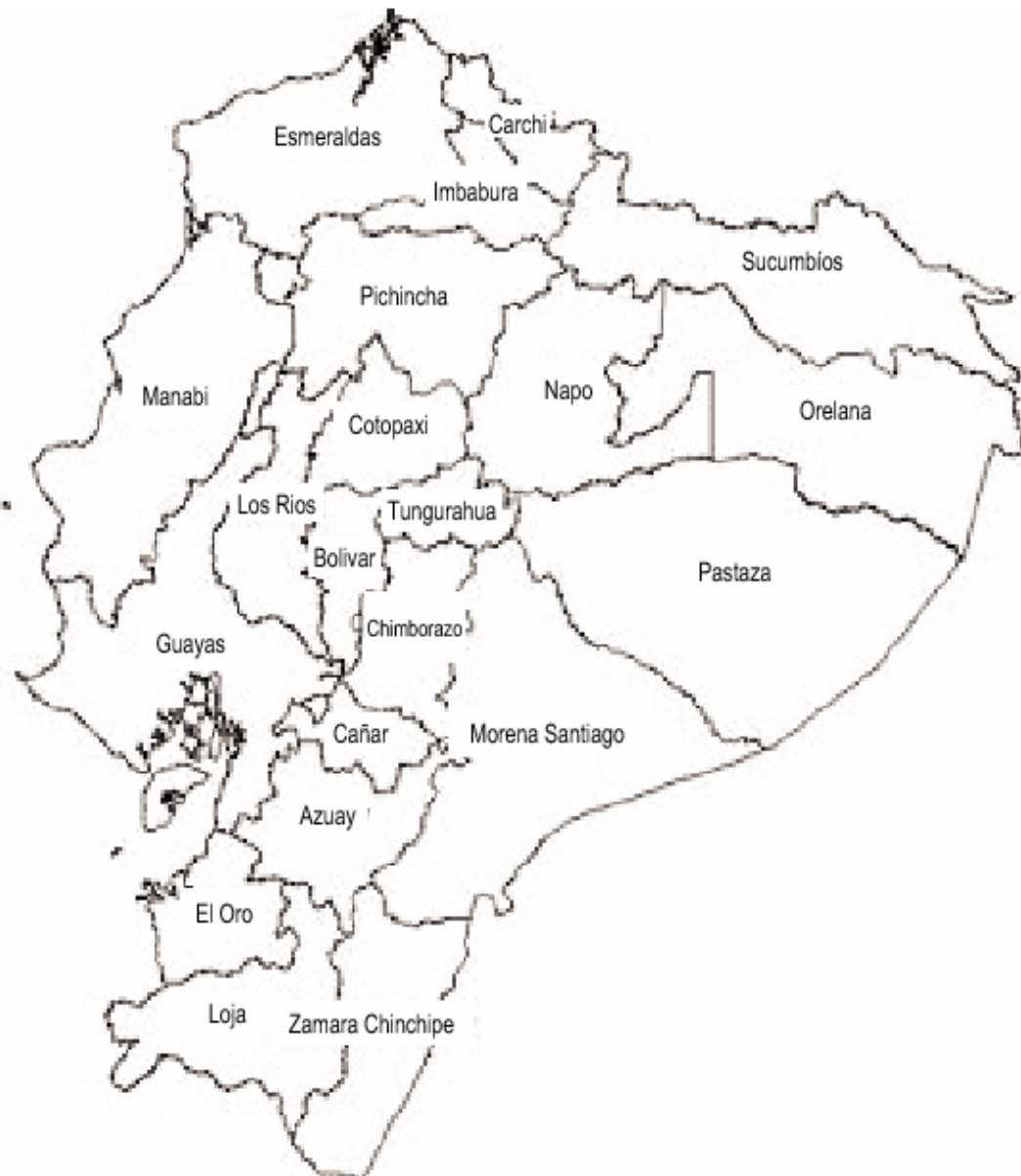
Figure 2 Map of Ecuador by province

denomination is used in Colombia (see Hornberger and Coronel-Molina, in press). In political arenas, national and local Indian organisations tend to use the Quichua term, runasimi or runashimi ('human language' /Q/), to underline the importance and strength of the language and its speakers within a space of political controversy. In the same vein, Amazon Quichua people have rejected all the names that mistakenly have been used to label them and their languages (e.g. Quijos , Alamas Yumbos ) and have chosen to identify themselves as Runas ('people' or 'person' /Q/) (Guerrero, 2001). Significantly, the word runa continues to be used by non-indigenous, Spanish-speaking Ecuadorians to connote 'poor', 'bad quality', or 'cheap' (Haboud, in press).